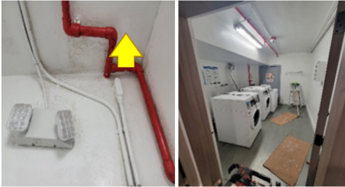
15 th floor - Dirty walls

Maintenance painted the walls of the laundry rooms