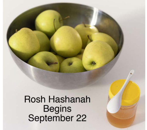
Rosh Hashanah Begins September 22

Before the event, reverent Jewish people in the United States may decide to seek forgiveness from friends and family they may have offended during the year just ending.