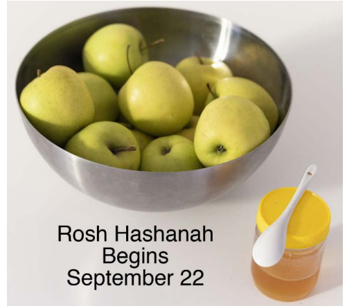
Rosh Hashanah Begins September 22

Before the event, reverent Jewish people in the United States may decide to seek forgiveness from friends and family they may have offended during the year just ending.