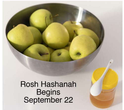
Rosh Hashanah Begins September 22

Before the event, reverent Jewish people in the United States may decide to seek forgiveness from friends and family they may have offended during the year just ending.