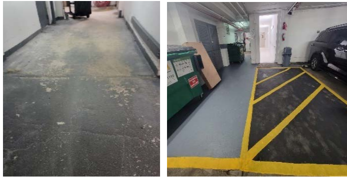
Trash Room floor – before & after

Maintenance painted the garage entrance floors.