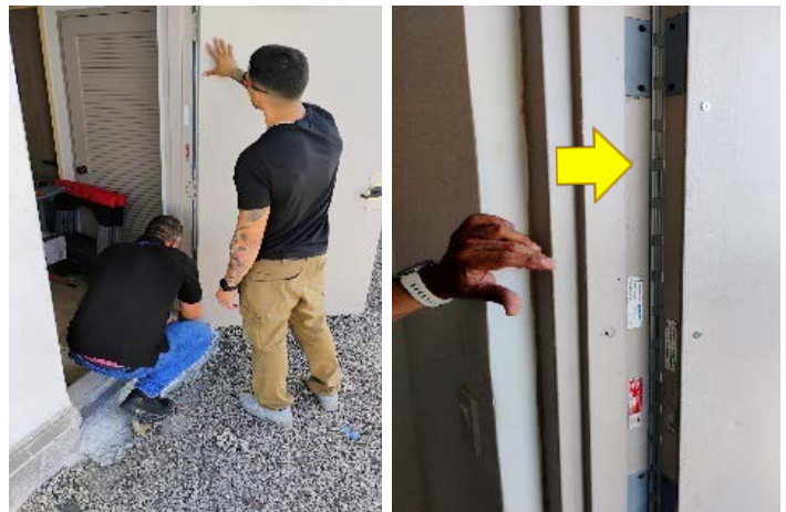
New continues hinge

Dash Door replaced the roof access door corrosive hinges with a continues hinge. They will also install an aluminium sweep to cover the gap on the bottom of the door.