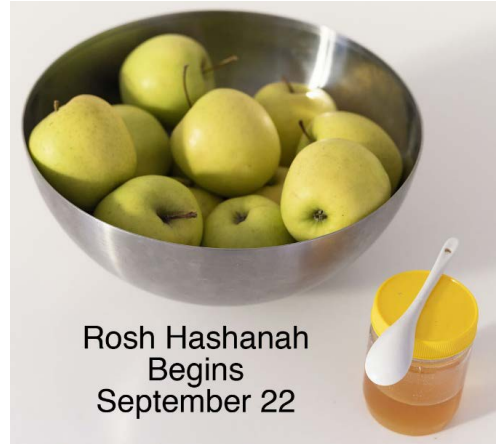
Rosh Hashanah Begins September 22

Before the event, reverent Jewish people in the United States may decide to seek forgiveness from friends and family they may have offended during the year just ending.