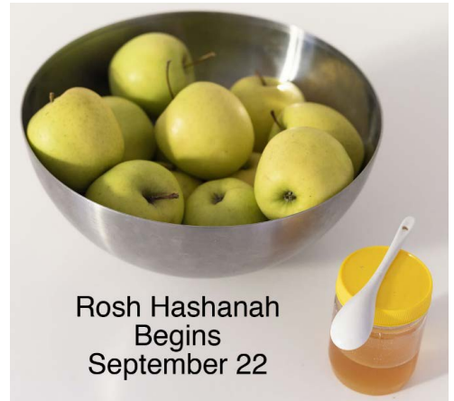
Rosh Hashanah Begins September 22

Before the event, reverent Jewish people in the United States may decide to seek forgiveness from friends and family they may have offended during the year just ending.