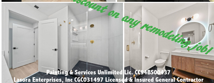
Painting & Services Unlimited Lic. CC94BS00437