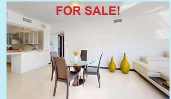
Building III - Unit 2409 $340,000 2B/2B