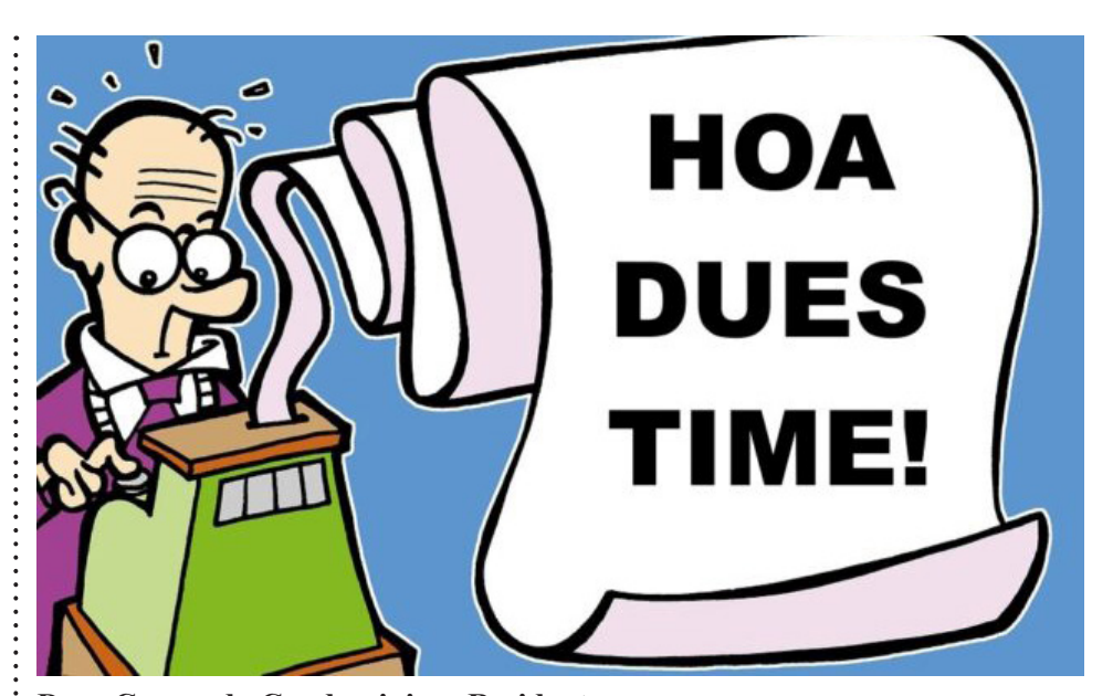
Dear Coronado Condominium Residents,

Published monthly at no cost for Coronado Condominium by Coastal Group Publications. Contact CGP at 305-981-3503 or www.cgpnewsletters.com to advertise in one of our newsletters or to get a free newsletter for your property.