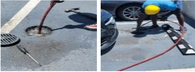
Upper deck parking drains cleaning

Itware repaired the faulty intercom system of the service entrance door of the 2 nd floor. The system was not working properly. Also, they moved the camera to the east side because the view was blocked by the construction shed.