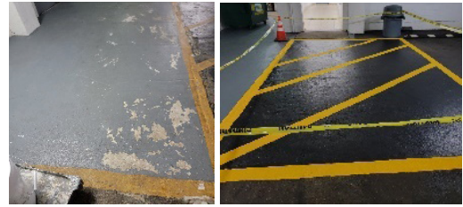
Garage south side

Maintenance painted the garage entrance floors.