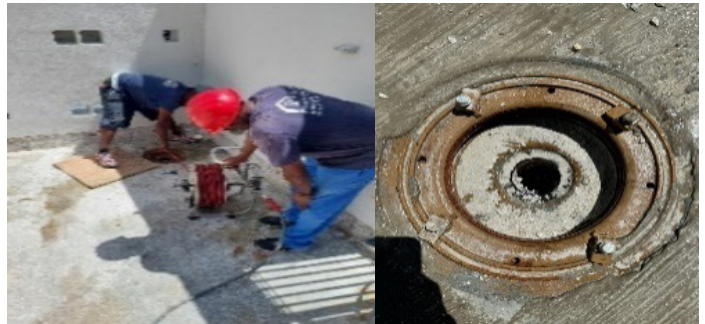
Pool Deck Drains