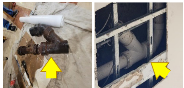
Damaged cast iron pipe

Fixxt Plumbing replaced a common area cast iron pipe and fittings located in the 1st lobby below unit 2D. The pipe was leaking to the lobby.