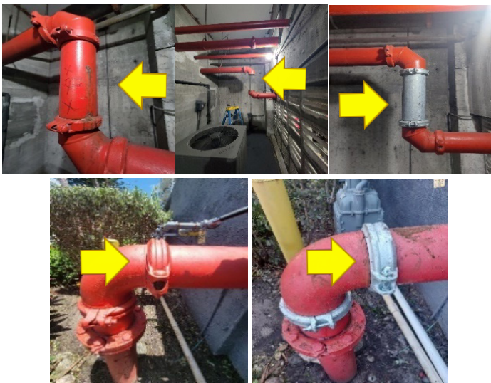
two (2) 6" Victaulic couplings between backflows

All Fire Services replaced leaking and corroded 6" pipe at fire pump suction side and replaced two (2) 6" Victaulic couplings between backflow and fire pump suction side outside of building on July 03, 2024.