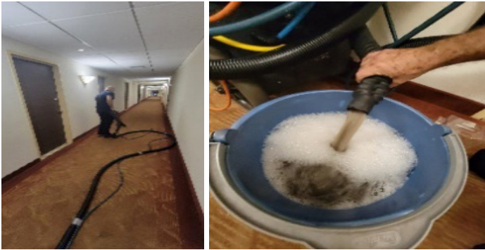
2 nd floor

Maintenance completed the hallway carpet cleaning