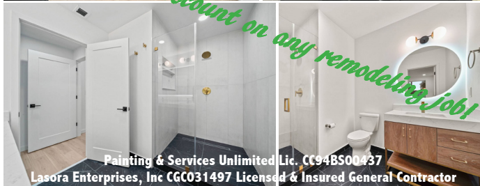
Painting & Services Unlimited Lic. CC948S00437 Lasora Enterprises, Inc CGC031497 Licensed & Insured General Contractor

Published monthly at no cost for Coronado Condominium by Coastal Group Publications. Contact CGP at 305-981-3503 or www.cgpnewsletters.com to advertise in one of our newsletters or to get a free newsletter for your property.