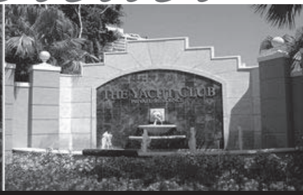
Volume 12 Issue 11

A Newsletter for the Residents of The Yacht Club at Aventura Condominium Association