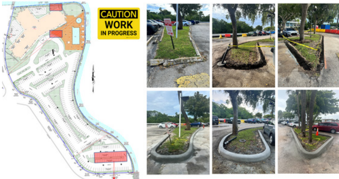
PLEASE DO NOT PARK IN THIS AREA, STARTING MONDAY, SEPTEMBER 11

contractors will work on the drainage lines along the seawall boundaries; parking lot milling & paving will be scheduled as follows: back on the building, front entrance, and back of the parking lot.