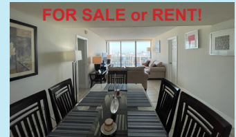
Building III - PH 2 $373,900 2B/2B. Rent: $2,850

Active & Sold Listing data was accessed through the MLS and information is deemed accurate, but not guaranteed.