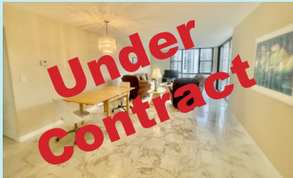
Building IV - Unit 803 $280,000 2/B/2B

Professional, Knowledgeable, & Superior Service "No one's more qualified to handle your real estate needs than your neighbor"