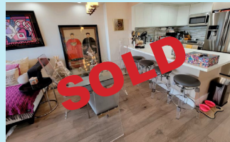
Building III - Unit 2605 $340,000 1B/1.5B