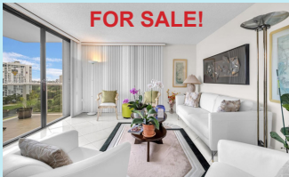
Building III - Unit 1609 $400,000 2B/2B