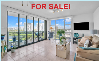
Building III - Unit 1109 $385,000 2B/2B