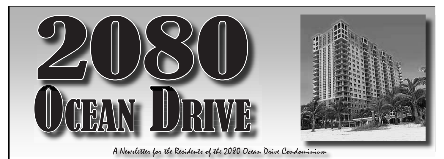
Volume 17 Issue 3