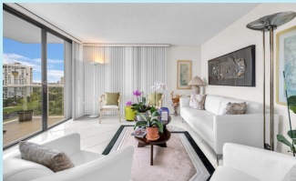
Building III - Unit 1609 $410,000 2B/2B