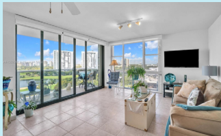
Building III - Unit 1109 $385,000 2B/2B