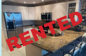
Building III - Unit 704 $2,800 Unfurnished