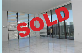
Building IV Unit 2103 $396,000. 2 beds 2 baths