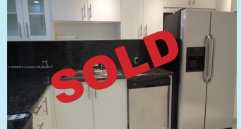
UNIT 109-4 $278,500 BUILDING IV

Active & Sold Listing data was accessed through the MLS and information is deemed accurate, but not guaranteed.