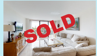
Building III $369,000 2 beds 2 baths unit 506