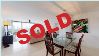
Building IV Unit 1006 $385,000 2beds 2 baths