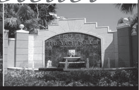
Volume 11 Issue 7