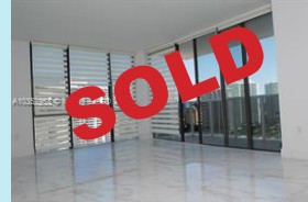
Building IV Unit 2103 $396,000. 2 beds 2 baths