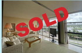
Building III - Unit 904 $258,000. 2beds 2 Baths