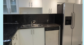
UNIT 109-4 $ 299,000 BUILDING IV

Active & Sold Listing data was accessed through the MLS and information is deemed accurate, but not guaranteed.