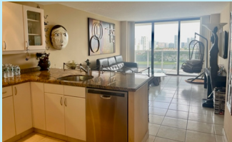
Building III - Unit 1907 $289,000 1B/1B updated kitchen