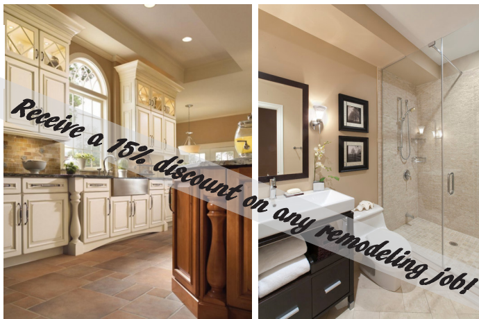
Painting & Services Unlimited Lic. CC94BS00437 • Lasorsa Enterprises, Inc CGC031497 Licensed & Insured General Contractor