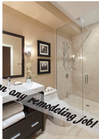
Painting & Services Unlimited Lic. CC94BS00437 • Lasorsa Enterprises, Inc CGC031497 Licensed & Insured General Contractor