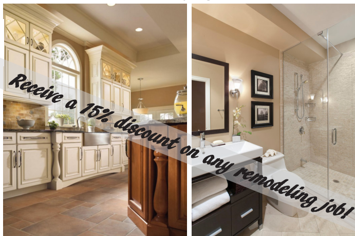
Painting & Services Unlimited Lic. CC94BS00437 • Lasora Enterprises, Inc CGC031497 Licensed & Insured General Contractor