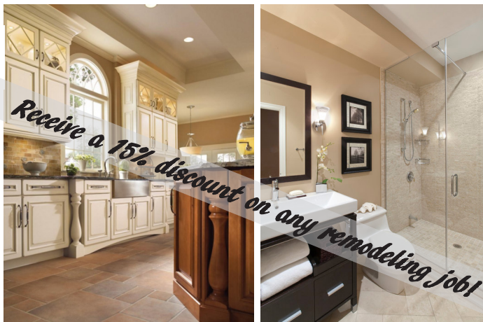
Painting & Services Unlimited Lic. CC94BS00437 • Lasorsa Enterprises, Inc CGC031497 Licensed & Insured General Contractor