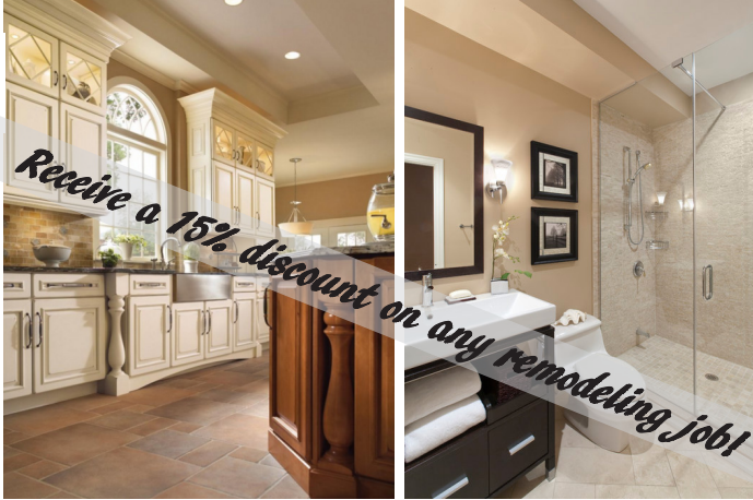
Painting & Services Unlimited Lic. CC94BS00437 • Lasora Enterprises, Inc CGC031497 Licensed & Insured General Contractor