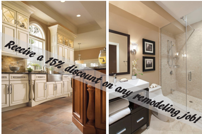
Painting & Services Unlimited Lic. CC94BS00437 • Lasora Enterprises, Inc CGC031497 Licensed & Insured General Contractor