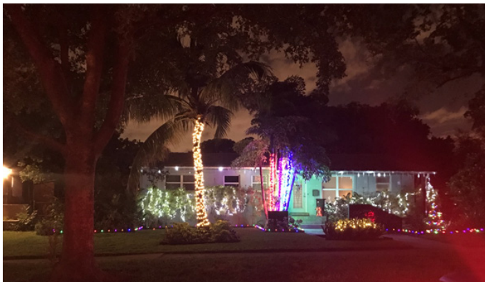
Second Place Winner: 450 NW 91 St - SHERA HANS-PAL & MANVIR DHANJAL