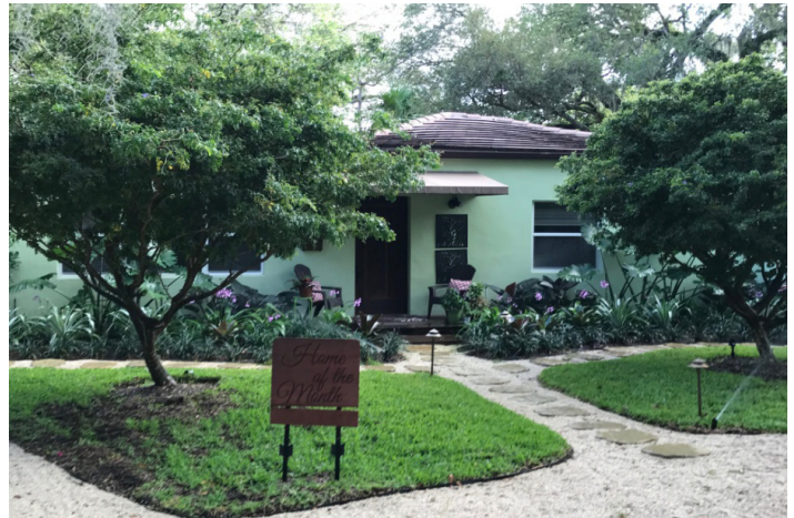
January Winner: 336 NE 86 th home of Lourdes C O Byrne