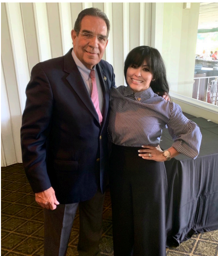
El Portal Mayor with County Commissioner Xavier Suarez at North Miami Chamber Meeting