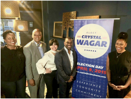
El Portal With North Bay Village Vice Mayor Jackson and Miami Gardens Mayor Olive Gilbert in Miami Shores!

We in El Portal are continuing to Create Community Connectedness - this creates progress regardless of the resources available to us and our long-list of differences that so often mistakenly divide us!