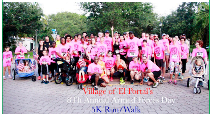
2016 Armed Forces 5K in El Portal