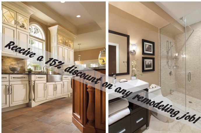
Painting & Services Unlimited Lic. CC94BS00437 • Lasora Enterprises, Inc CGC031497 Licensed & Insured General Contractor