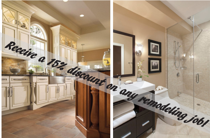
Painting & Services Unlimited Lic. CC94BS00437 • Lasora Enterprises, Inc CGC031497 Licensed & Insured General Contractor