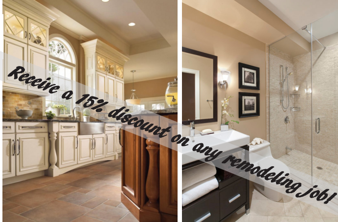
Painting & Services Unlimited Lic. CC94BS00437 • Lasora Enterprises, Inc CGC031497 Licensed & Insured General Contractor