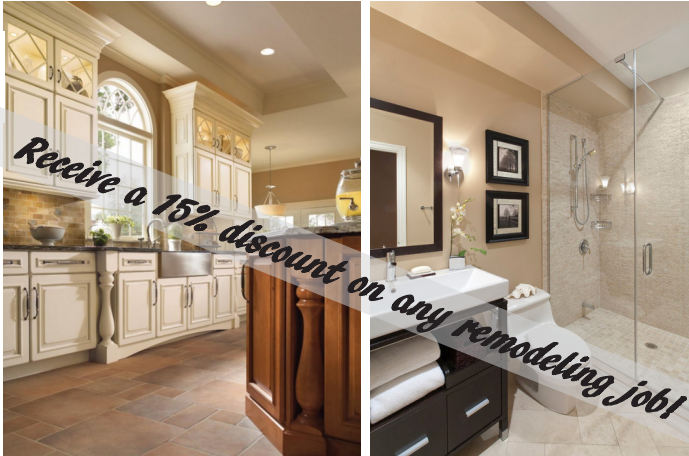
Painting & Services Unlimited Lic. CC94BS00437 • Lasora Enterprises, Inc CGC031497 Licensed & Insured General Contractor