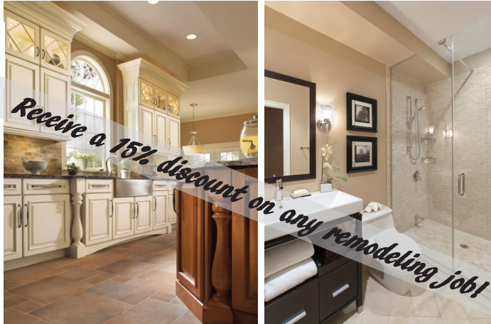
Painting & Services Unlimited Lic. CC94BS00437 • Lasora Enterprises, Inc CGC031497 Licensed & Insured General Contractor