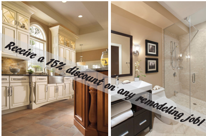
Painting & Services Unlimited Lic. CC94BS00437 • Lasora Enterprises, Inc CGC031497 Licensed & Insured General Contractor