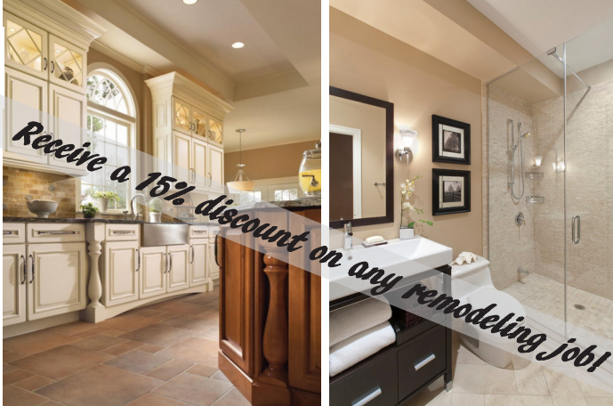
Painting & Services Unlimited Lic. CC94BS00437 • Lasora Enterprises, Inc CGC031497 Licensed & Insured General Contractor