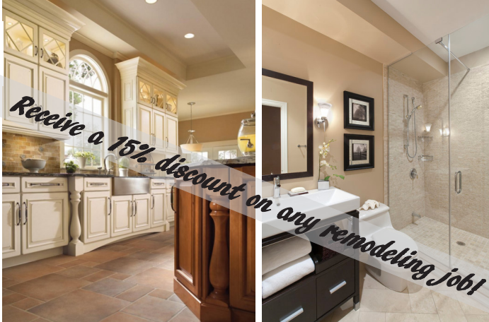
Painting & Services Unlimited Lic. CC94BS00437 • Lasora Enterprises, Inc CGC031497 Licensed & Insured General Contractor