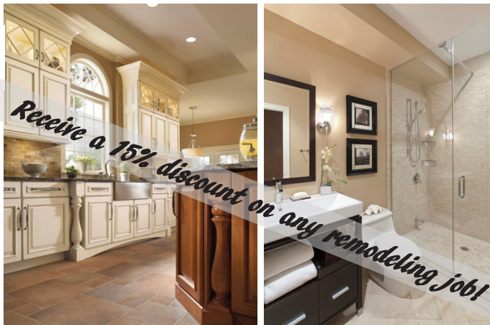
Painting & Services Unlimited Lic. CC94BS00437 • Lasora Enterprises, Inc CGC031497 Licensed & Insured General Contractor