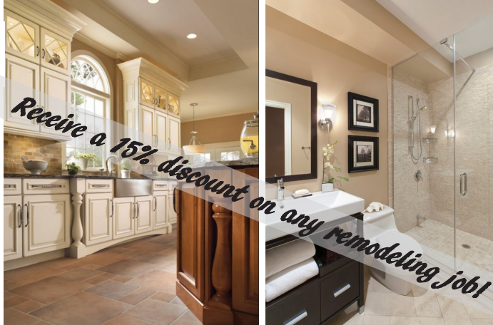
Painting & Services Unlimited Lic. CC94BS00437 • Lasorsa Enterprises, Inc CGC031497 Licensed & Insured General Contractor