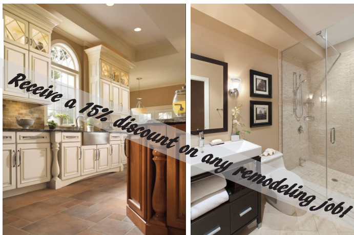
Painting & Services Unlimited Lic. CC94BS00437 • Lasora Enterprises, Inc CGC031497 Licensed & Insured General Contractor