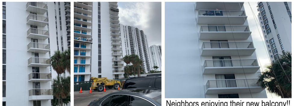
Neighbors enjoying their new balcony!!

Please see pictures of rear balconies Tower 1 - 08 line.