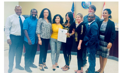
Childhood Cancer Proclamation presented at the September Council Meeting