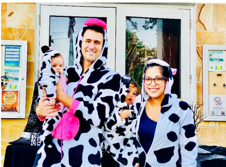
Great to have this amazing family living back in El Portal - welcome back!!