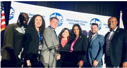
El Portal attended the Miami Dade County League of Cities Best Practices in October of 2019