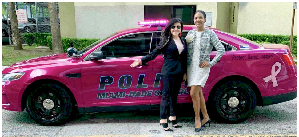
Collaborating with Miami Dade County Public School Board to acquire a necessary easement for phase 1 of our Septic to Sewer.