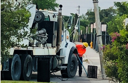
Collaborating with Miami Dade County