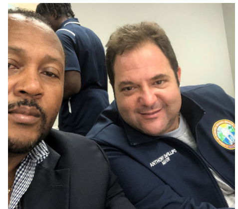
Shout out to the North Miami Beach Manager and Mayor for checking in on us during the possible anticipation of Hurricane Dorian.