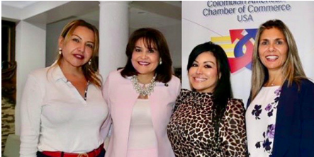
Discussing economic development with Senator Tadeo.