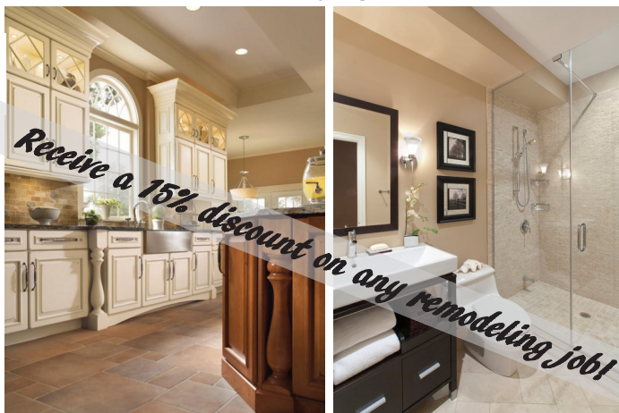
Painting & Services Unlimited Lic. CC94BS00437 • Lasora Enterprises, Inc CGC031497 Licensed & Insured General Contractor