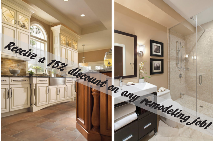
Painting & Services Unlimited Lic. CC94BS00437 • Lasora Enterprises, Inc CGC031497 Licensed & Insured General Contractor