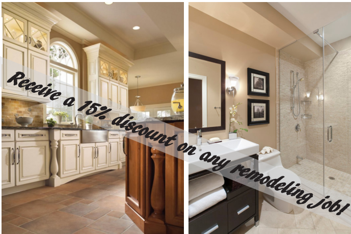
Painting & Services Unlimited Lic. CC94BS00437 • Lasorsa Enterprises, Inc CGC031497 Licensed & Insured General Contractor