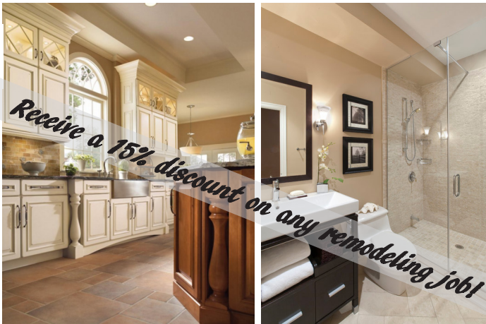
Painting & Services Unlimited Lic. CC94BS00437 • Lasora Enterprises, Inc CGC031497 Licensed & Insured General Contractor