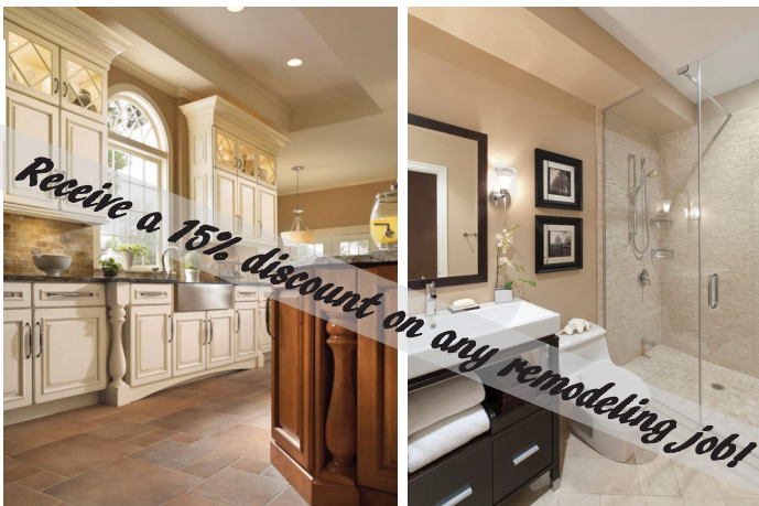
Painting & Services Unlimited Lic. CC94BS00437 • Lasora Enterprises, Inc CGC031497 Licensed & Insured General Contractor