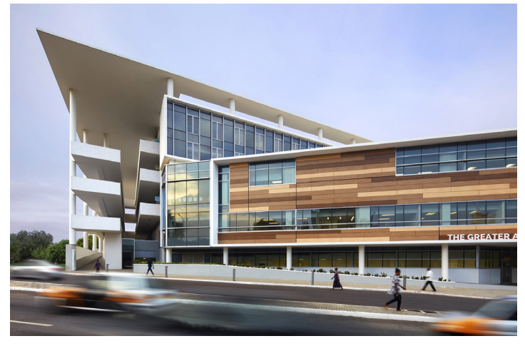
The Greater Accra Regional Hospital at Ridge, Accra, Ghana

globalization. Today he teaches two courses on world and contemporary architecture.