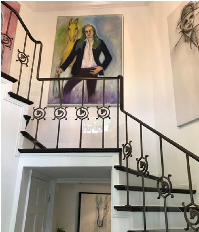
Boy with Golden Horse on top of stairs in studio house