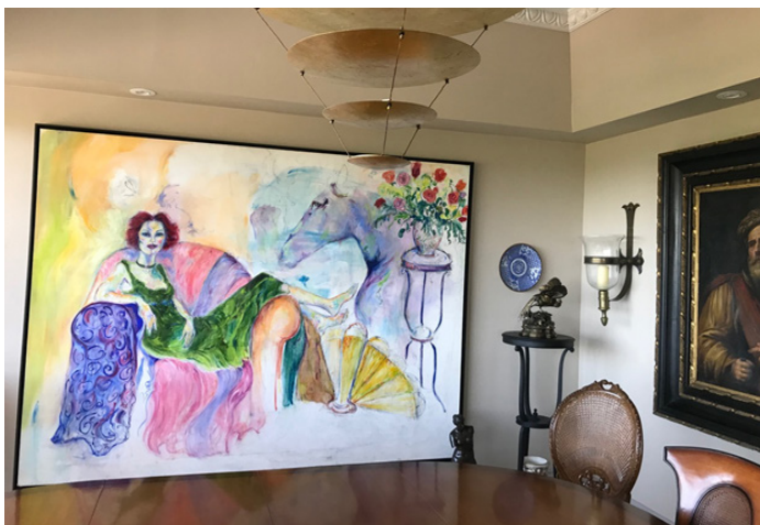
Fleurs de Pamela