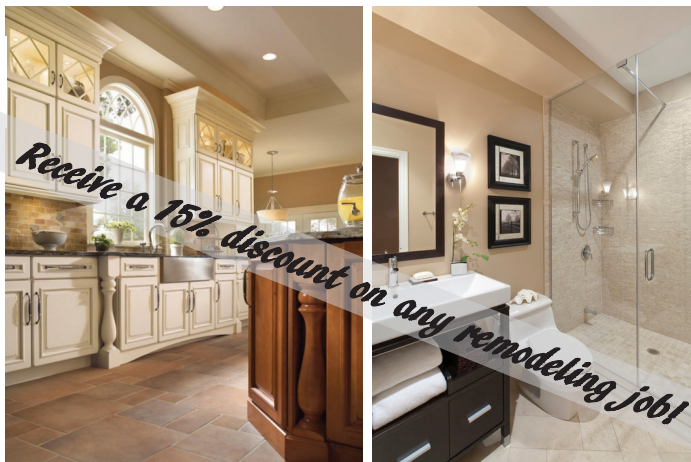
Painting & Services Unlimited Lic. CC94BS00437 • Lasora Enterprises, Inc CGC031497 Licensed & Insured General Contractor