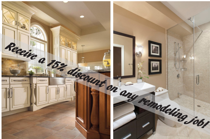
Painting & Services Unlimited Lic. CC94BS00437 • Lasorsa Enterprises, Inc CGC031497 Licensed & Insured General Contractor